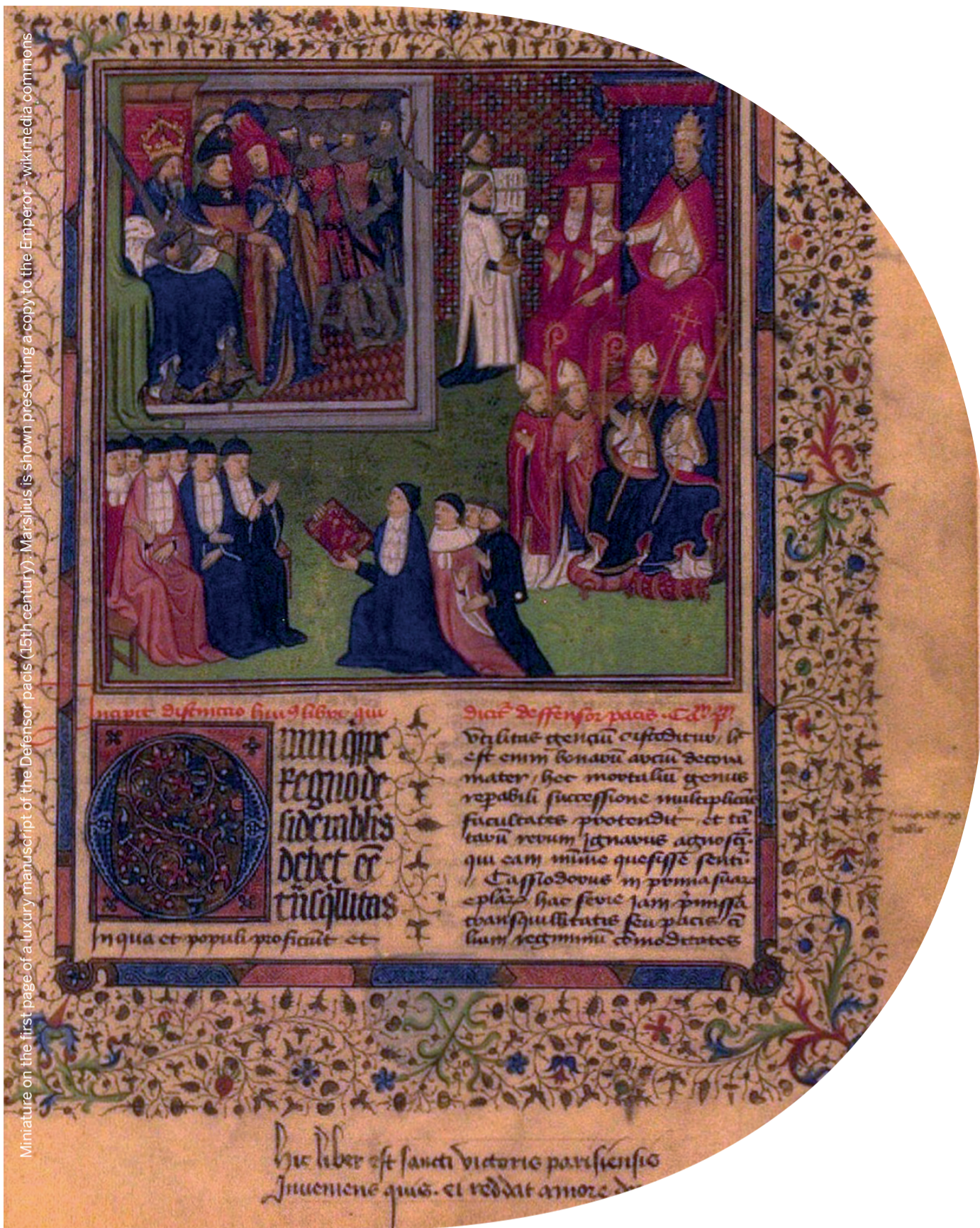
Miniature on the first page of a luxury manuscript of the Defensor pacis (15th century). Marsilius is shown presenting a copy to the Emperor.